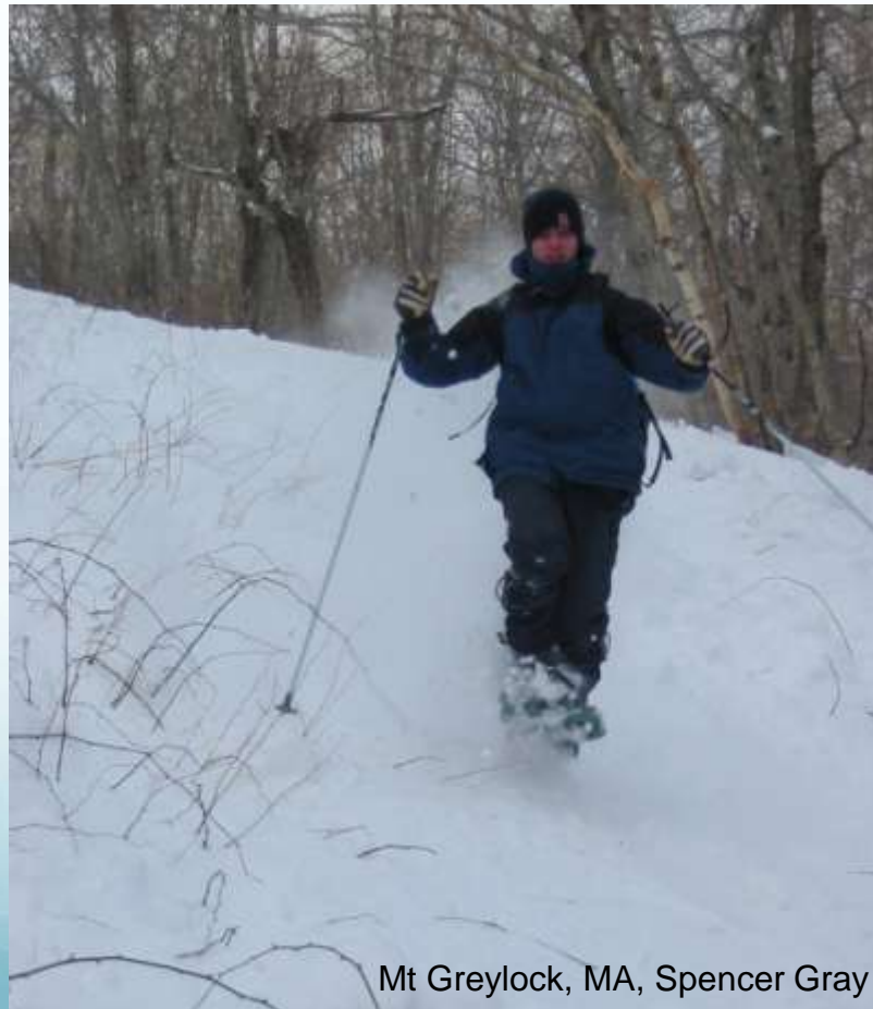
Mt Greylock, MA, Spencer Gray