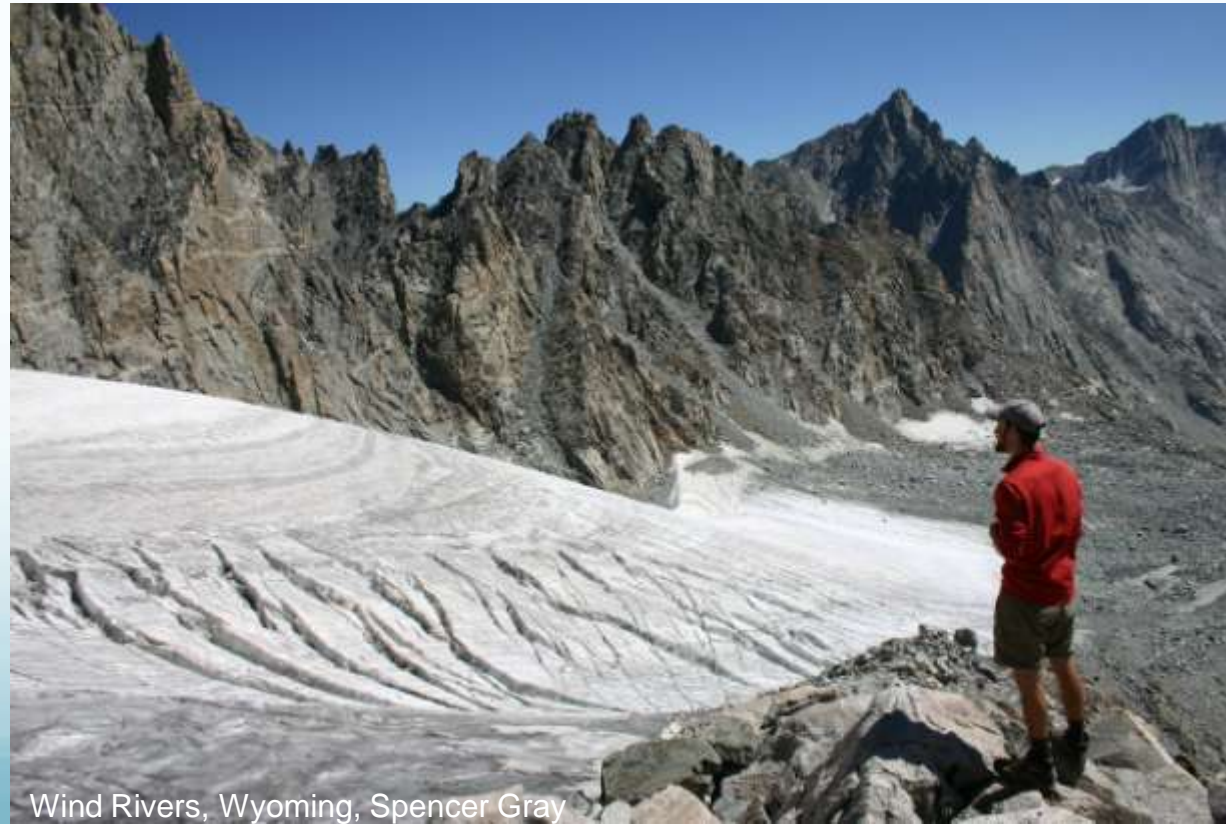
Wind Rivers, Wyoming, Spencer Gray